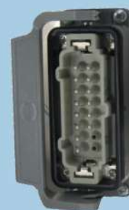
motor output X1 16pol.